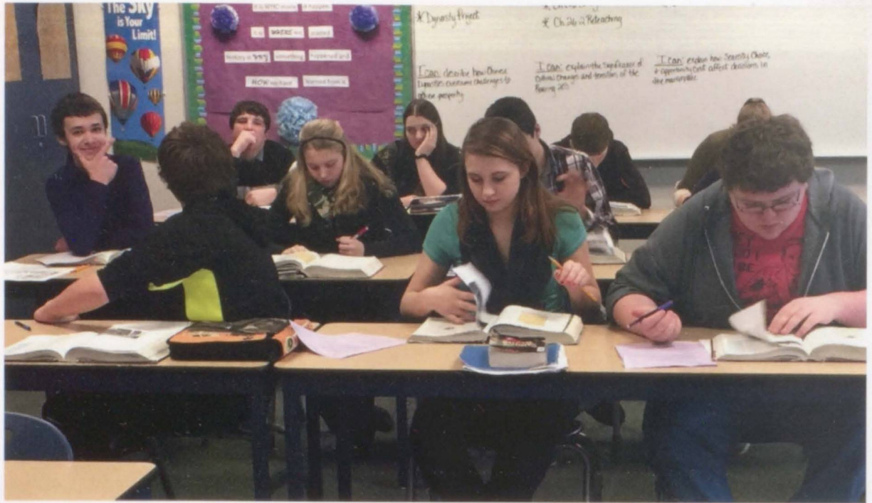
*Pay attention* Sophomores complete their outlines and study for their upcoming test.